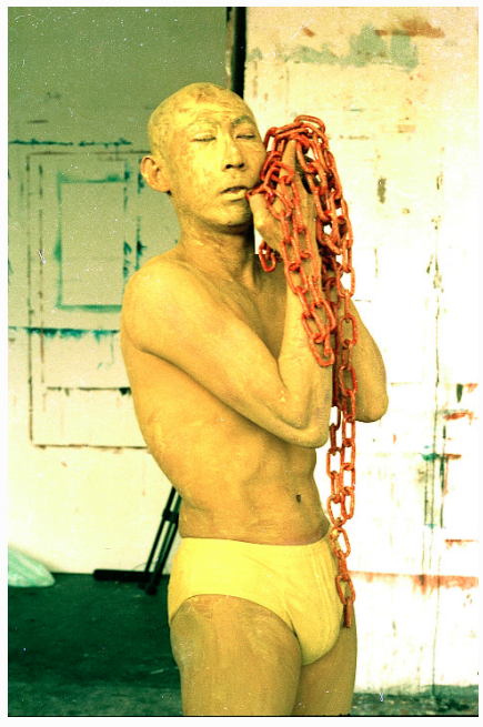
Figure 7 Lee Wen, Journey of the Yellow Man , 1992 (City of London, Polytechnic).

was acceptable to Manchester Art Gallery. While transgressive acts by artists have been canonised as part of performance art history, Tee's proposal for cutting his body was prohibited by Manchester Art Gallery to avoid seeming to condone self-harm in youth, which an increasing social concern for the city of Manchester.