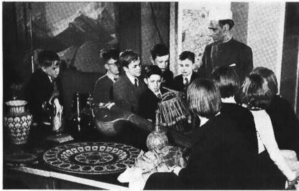
How the tabla (drum) is played—part of a lesson on India.